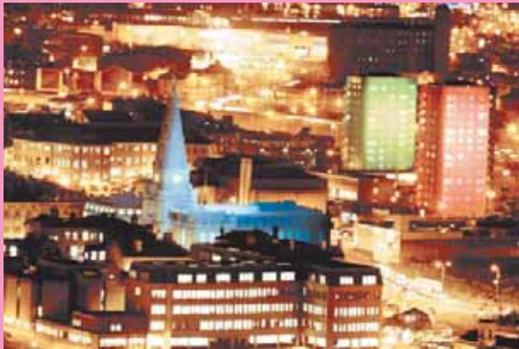
A VIEW OF THE TOWN WITH BUILDINGS ILLUMINATED